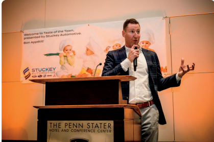
Stuckey Automotive title sponsors for Taste of the Town 2021