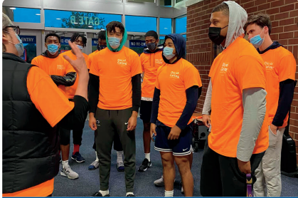
Community members gather for Day of Caring powered by PNC

Some examples of your neighbors and our supporters showing up to LIVE UNITED: