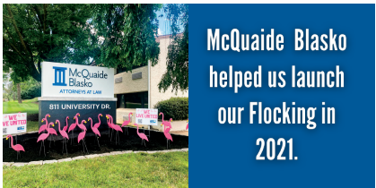
McQuaide Blasko helped us launch our Flocking in 2021.