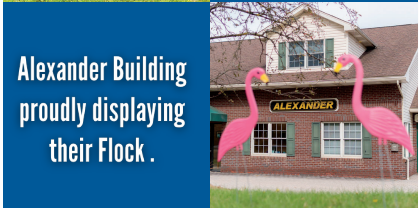
Alexander Building proudly displaying their Flock.