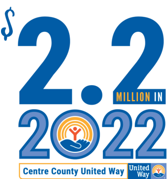
Centre County United Way United Way