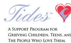
A SUPPORT PROGRAM FOR GRIEVING CHILDREN, TEENS, AND THE PEOPLE WHO LOVE THEM.