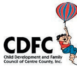
Child Development and Family Council of Centre County, Inc.