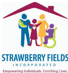
Empowering Individuals. Enriching Lives.