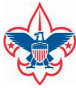
Bucktail Council Juniata Valley Council