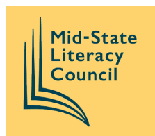
Mid-State Literacy Council