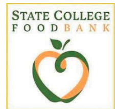
STATE COLLEGE FOOD BANK